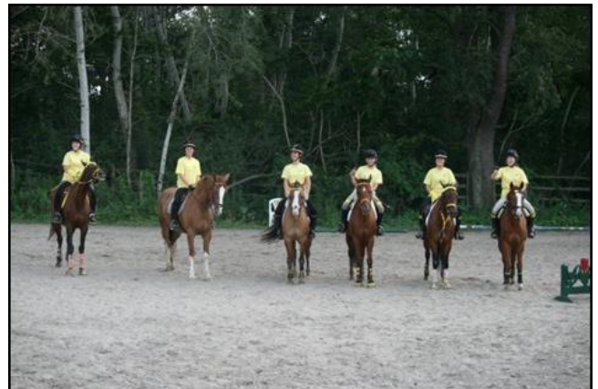
Camp staff is easy to find in their bright yellow tees!

Office Hours are 9:00am – 4:00pm, Monday to Friday.